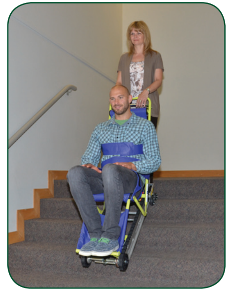
When ready to descend the next flight, the attendant squeezes the Brake Release Bar to release the secondary, failsafe brake.