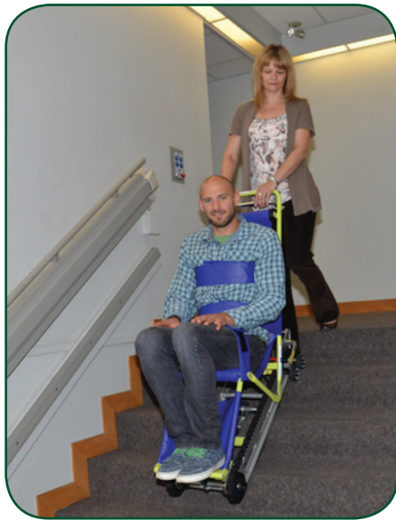
During descent the passenger sits in a comfortable, upright position, securely held by three safety straps.

During an emergency, the passenger is transferred from their wheelchair to the Evacu-Trac. Once positioned in the Evacu-Trac, velcro straps are wrapped securely around the passenger's torso and lower legs. The passenger is then wheeled to the stairway for descent.