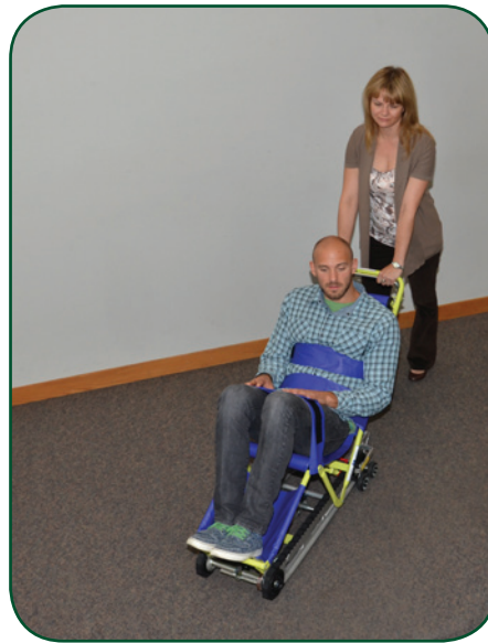
To turn the Evacu-Trac on flat surfaces, the attendant pushes down on the handle and pivots the unit on the rear auxiliary wheels.