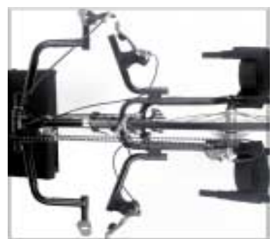
The Top End S crankset is designed to keep the power over the cranks while clearing your legs. The wide "S" shape plus choice of crank lengths will allow you to customize your power stroke.