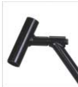
The handpedals feature integral pedal bearings and are made of lightweight ovalized aluminum to precisely fit your hand which make this pedal ideal for long distance riding.