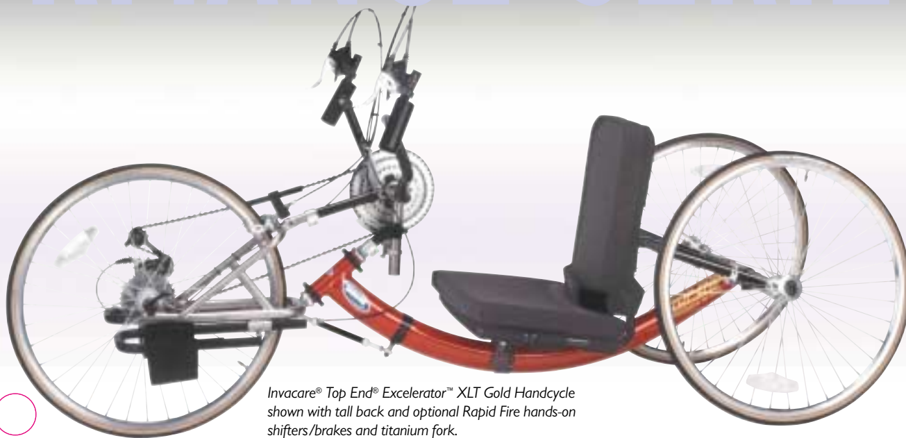
Invacare® Top End® Excelerator™ XLT Gold Handcycle shown with tall back and optional Rapid Fire hands-on shifters/brakes and titanium fork.