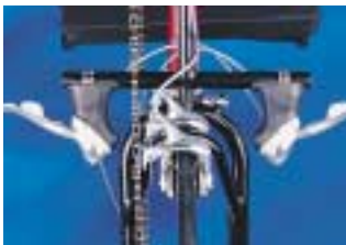
STI-indexed shifters/brake levers.