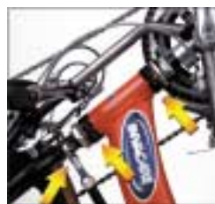
Travel-ready, removable fork.