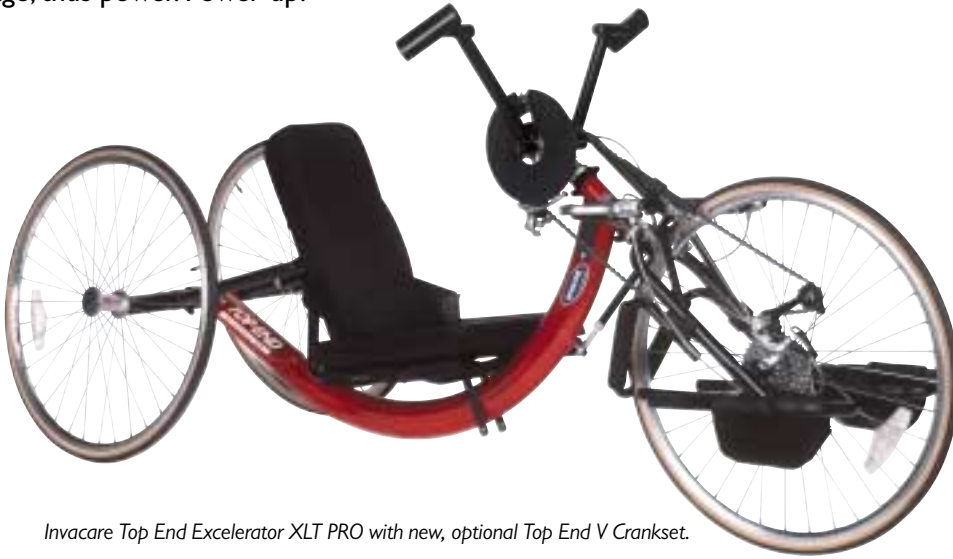
Invacare Top End Excelerator XLT PRO with new, optional Top End V Crankset.

The Invacare® Excelerator™ XLT PRO with the optional Top End® V Crankset will deliver the power to the pedals with its longer crank length and wide stance. Designed for handcycle competitors who want maximum power in a recumbent position, the Top End V crankset is custom-made by Top End with integral pedal bearings and offered in 180mm, 200mm, and 220mm lengths. By integrating the bearings in the crankset instead of the pedal shaft, the pedals are much more comfortable. The wider V shape of the cranks maximizes the power transfer of the arm stroke to the chain ring (by recruiting more muscles in this action), which turns the front wheel, making the rider go faster. The long crank arms give you more leverage, thus power. Power up!