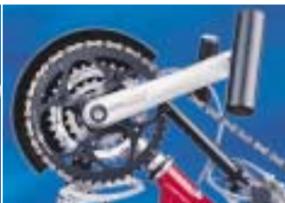
27 speeds with Shimano Ultegra/XT components.