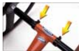
Travel-ready, removable camber tube.