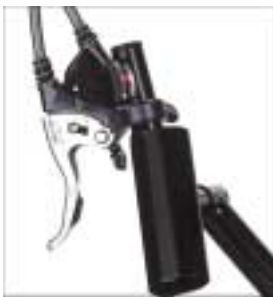
Optional Rapid Fire hands-on Shifters/brakes.