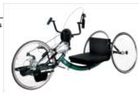
XLT Gold Handcycle is shown with low back, STI shifters and hands-on brake.