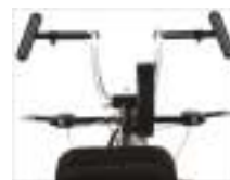
Pro-width adjustable Delrin handpedals.